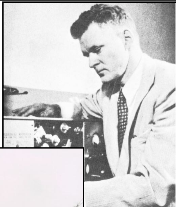
rama 6-channel sound-head circa 1948