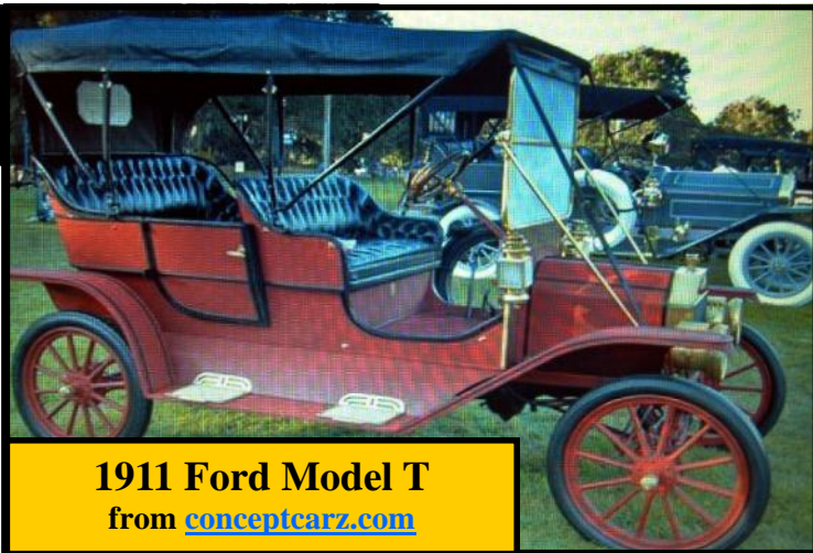
1911 Ford Model T

...The population of Las Vegas, Nevada was 30?